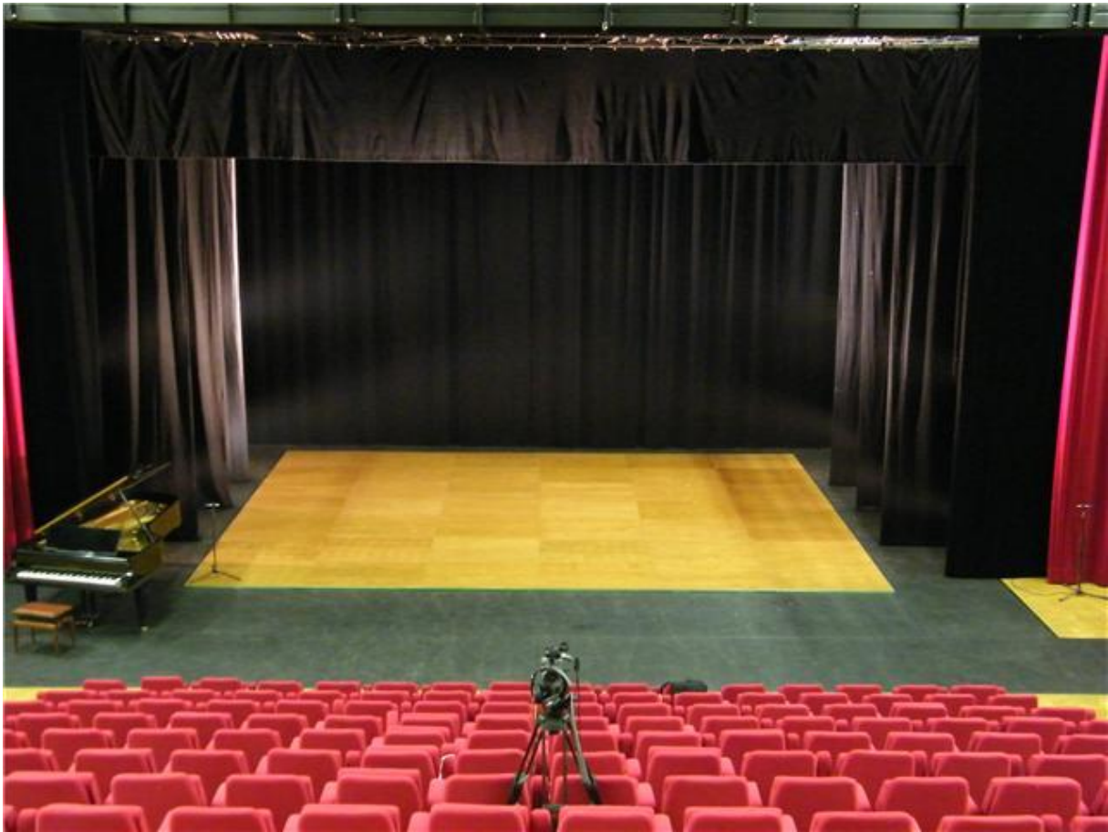
Wooden floor on light stage floor covered on edges by black dance floor